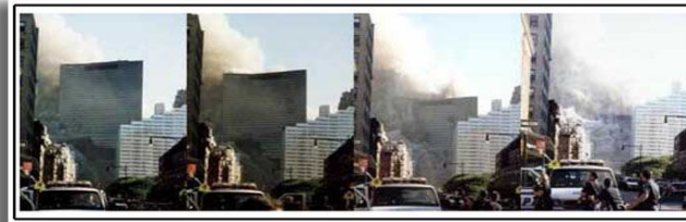
Time-lapse sequence of WTC Building 7, a 47 story skyscraper that collapsed at free-fall acceleration at 5:20 PM on 9/11/2001

The Mysterious Collapse of World Trade Center 7: Why the Final Official Report About 9/11 Is Unscientific and False By David Ray Griffin